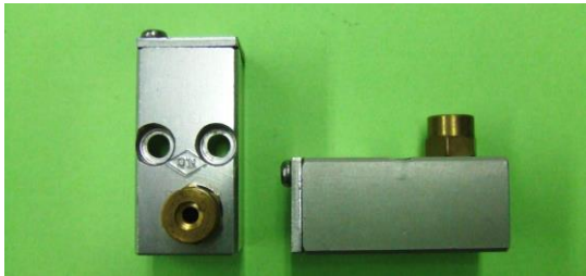
(C V - 1 2 0)